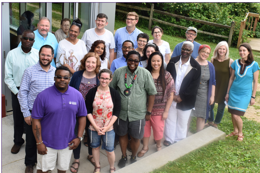
Participants in the 2019 Emerging Religious Leaders program